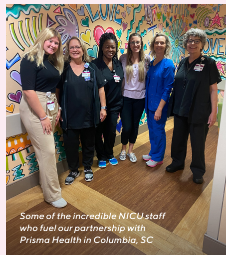
Some of the incredible NICU staff who fuel our partnership with Prisma Health in Columbia, SC

At UNC Children's Hospital, we were able to provide the NICU with 128 meal cards and a cuddle cot with the funds raised from our March Madness Bracket Challenge. A cuddle cot is a small, portable unit used by families who experience loss to allow them more time with their infant, thereby improving their appearance, condition, and dignity. We are honored to support UNC Children's Hospital in this meaningful way.